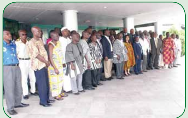
A group photograph after the Forum.