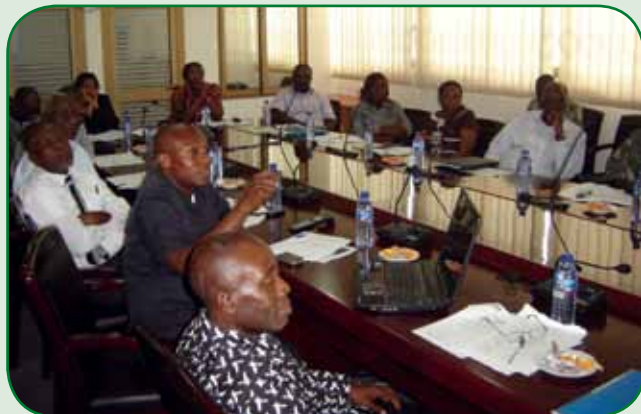
NCC members at the meeting.