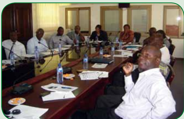
NCC members at the meeting.