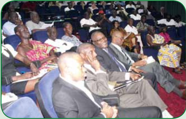
Strong presence from the BPA in the first row, including the CEO.