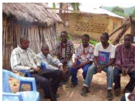
The reality of resettlement shown on the faces of residents.

The construction of the Bui Hydropower Dam at the Bui gorge will affect a number of communities in the dam catchment area due to the permanent inundation of about 440 square kilometers of land. As part of the efforts to ensure the successful implementation of the Bui Dam Project, it has become necessary to