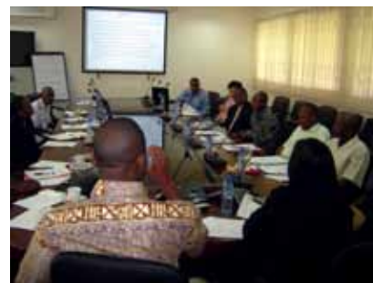
NCC members at the Tenth Meeting of the NCC.

During the last half of the year, the NCC of the Ghana Dams Dialogue (GDD) met three times to steer and plan for activities of the Dialogue process.