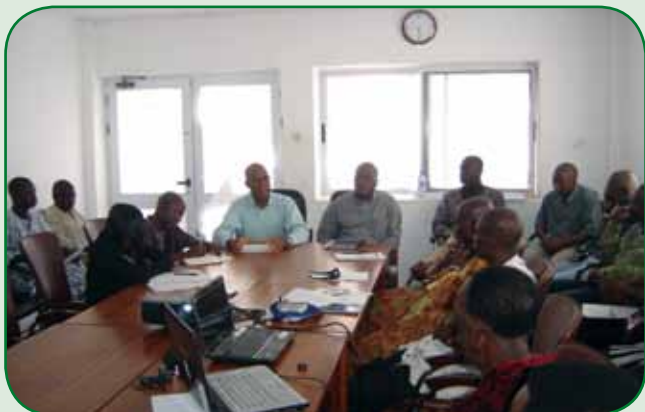
CEO and Financial Controller of the BPA, opening the meeting.