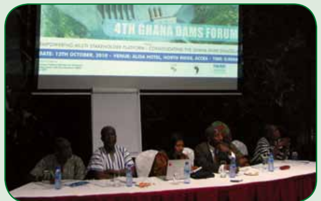
The NCC members leading the second session of the Forum.