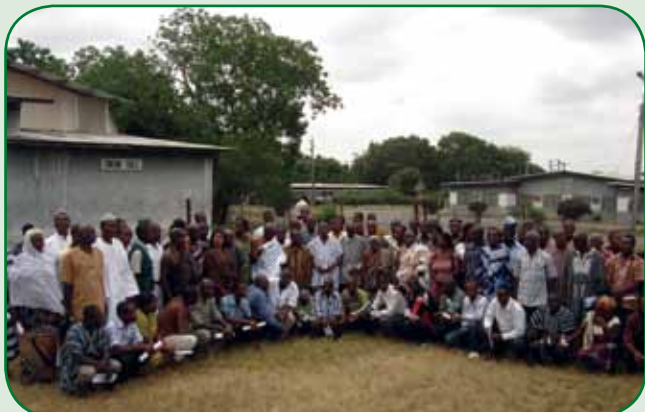
Group photograph of participants of the Second Annual Meeting of Dam-Affected Communities.