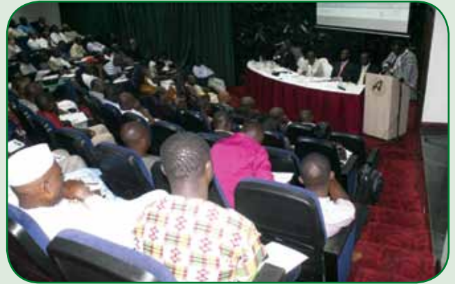
Hon. Kwesi Ahwoi, Minister of Food and Agriculture, delivering a speech on behalf of the Vice President of Ghana.