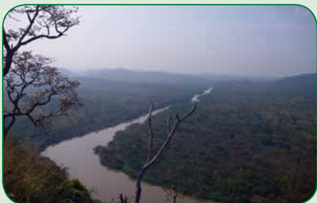
Bird's-eye view of the Black Volta before the dam showing areas of possible inundation.