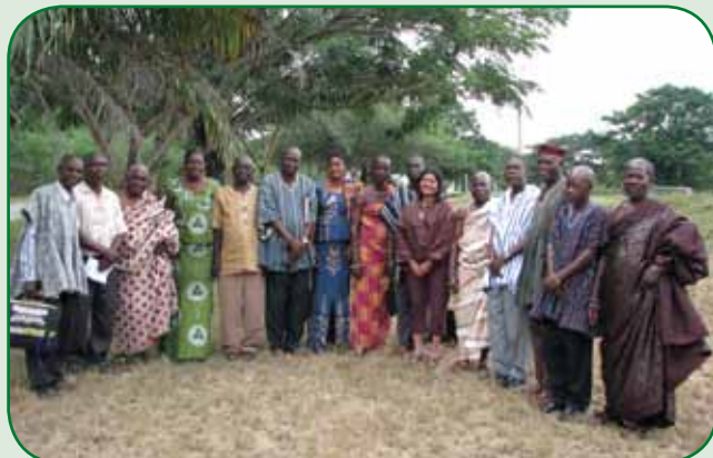
Community leaders of affected communities posing with representatives of the GDD.