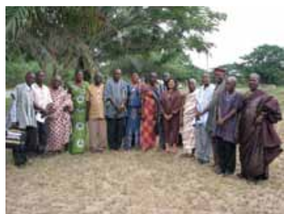
Leaders of DACs pose with some members of the GDD.

The Second Annual Meeting of DACs in Ghana was held on July 30, 2010, at Volta River Authority (VRA) Cinema Hall, Akuse, Ghana, between 8:00 and 14:00 GMT. The meeting was organized by the GDD for the National Association of the 52 VRA Resettlement Townships (NAVRART-52). A total of 88 participants attended the meeting comprising of representatives from the VRA; district chief executives (DCEs); paramount chiefs divisional chiefs; subdivisional chiefs; and heads of DACs of the Akosombo, Kpong and the Bui Hydropower dams. The meeting which was themed "Building Synergies and Cohesion between Dam-Affected Communities" was aimed to provide a platform for the DACs to deliberate on issues affecting them, and to also position themselves well into a situation where there were no funds to support their annual meeting. The meeting was also used to give feedback from the Hydropower Sustainability Assessment Protocol (HSAP) Consultation to the DACs in Ghana who had actively participated in trialling the protocol.