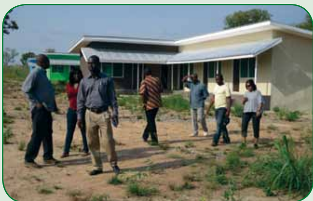
Officials of the BPA and GDD Secretariat touring resettlement 2 site.