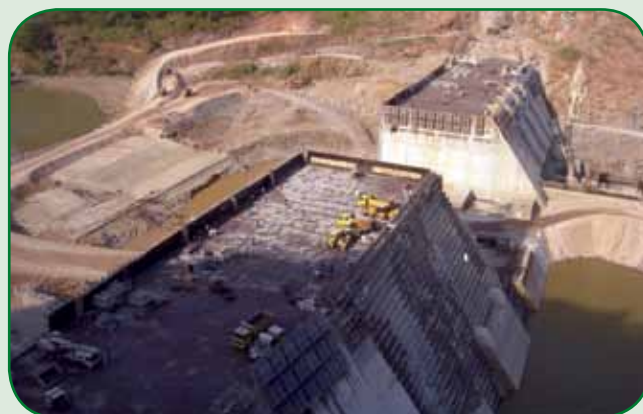
The current stage of the construction of the Bui Hydropower Project.