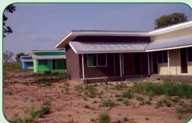
Some buildings at the resettlement 2 site.