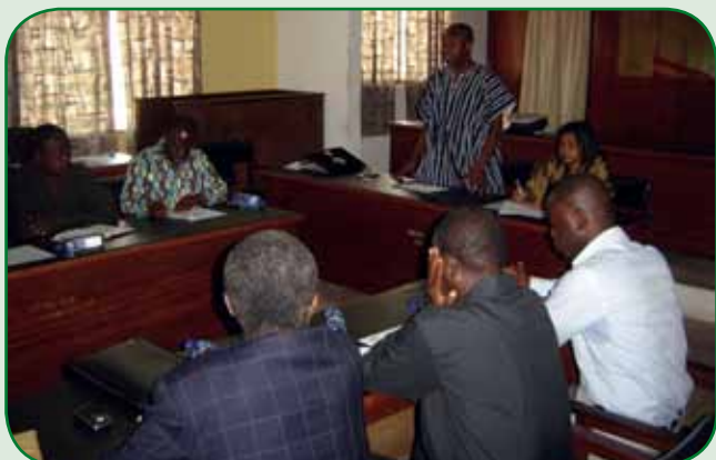
Members at the Eleventh meeting of the NCC.