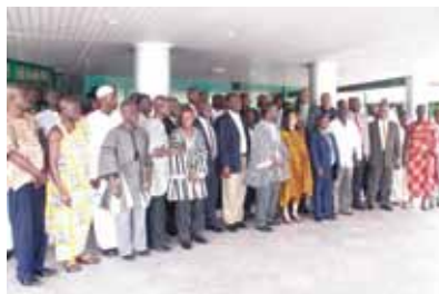
Group photo of participants at the Fourth Ghana Dams Forum.

On October 12, 2010, the GDD held the Fourth Ghana Dams Forum in Accra, Ghana. The Forum saw increased attendance and participation over previous years, which was a sign of a well coordinated national dialogue. This is also recognition of the fact that it is the first successful dialogue on dam development in West Africa.