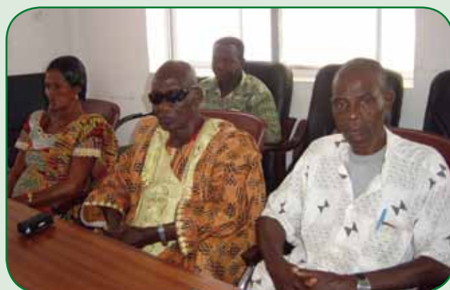
Some community leaders and representatives at the meeting.