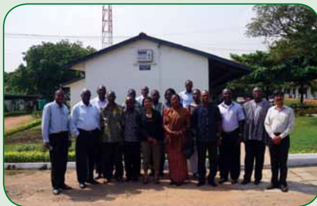
Group photograph of participants at the meeting.