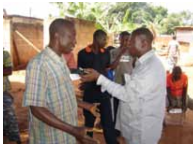
Pressmen interacting with a member of the Ajena community.

On September 21, 2010, a group of journalists from about 10 media houses embarked on a field trip to the Akosombo and Kpong hydropower projects and some resettlement towns at the invitation of the GDD. The overall objective of the trip was to build the capacity of the participants for effective reporting on dam development issues. It also allowed the participants to assess the impact of the two historic projects and learn firsthand about efforts being instituted to address some of the challenges. The group also reflected on the lessons learned which could be useful for the ongoing Bui hydropower project. After the visits, a short press conference was held to inform them of the forthcoming Fourth Ghana Dams Forum.